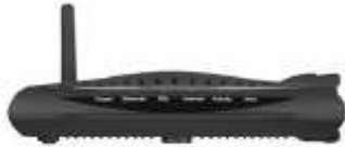
Example Front Panel